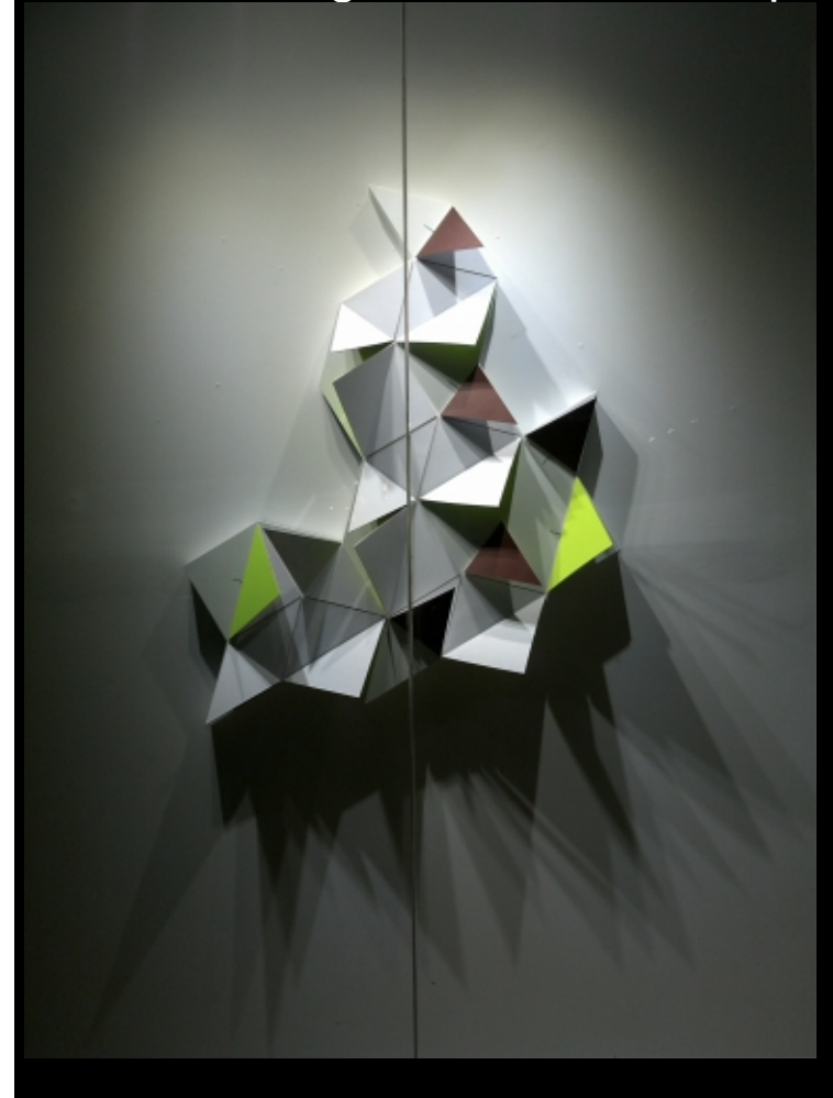
Lab[au], "Origam1," 2014.

mounted triangles, activated by memory alloy springs, slowly flips between white, red, green, and blue. While Lab[au] employs technology to control their work, Nonotak and François Wunschel rely on light, plexiglas, and geometry to endow two-dimensional objects with three-dimensional properties. Basic geometric images become complex as viewers activate Plexiglas and lenticular prints with their eyes.